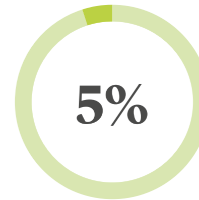
5% will leave employment due to a caring role