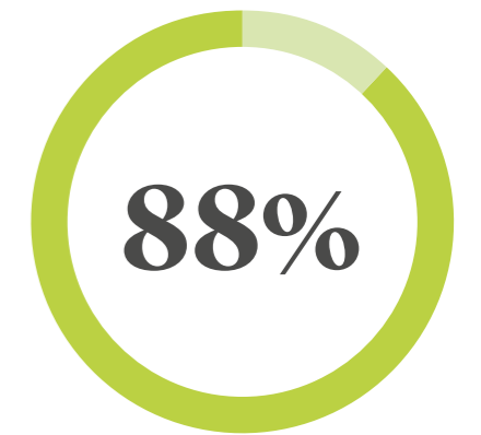
88% of employees do not feel supported by their employer when it comes to the later life care space*

Staff members affected are usually in the 45-65 age bracket, and at the peak of their working careers. So, the cost to business isn't just about time out or leaving a role. If staff members have to struggle on