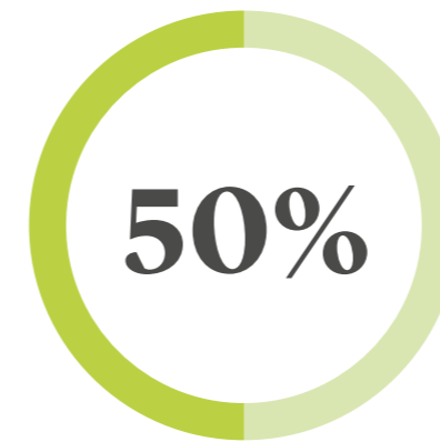
50% of employees take time off work due to an elderly care need for a loved one

With an ageing population, the need for later life care is growing. Therefore, the potential impact upon the workplace also faces considerable increase. Research shows us that: